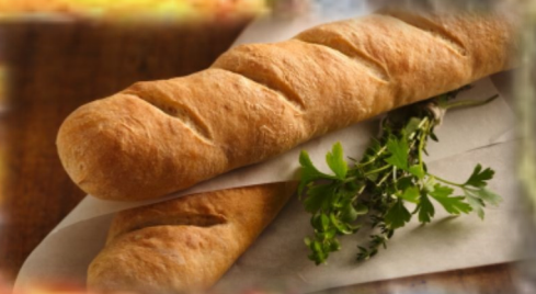
French Bread loaf