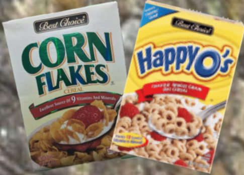
Best Choice Corn Flake and Happy O's 14-18oz