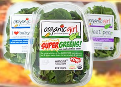
Organic Girl 5oz Salad mixes