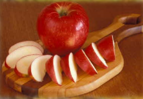
Honey Crisp Apples