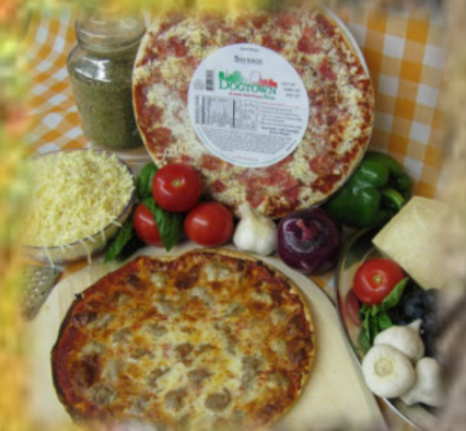
Dogtown Pizza 12"