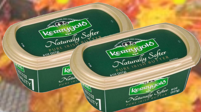
Kerrygold Irish Butter 8oz